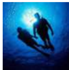
Diving Center PADI 5 Star