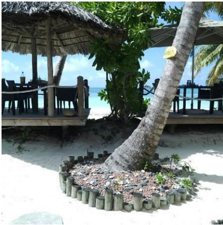
Restaurant area on the Beach