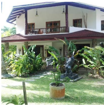
Outside Superior rooms

Complimentary Wi-Fi available throughout the hotel.