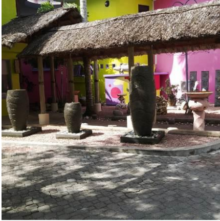
Entrance to Spa and Café des Arts