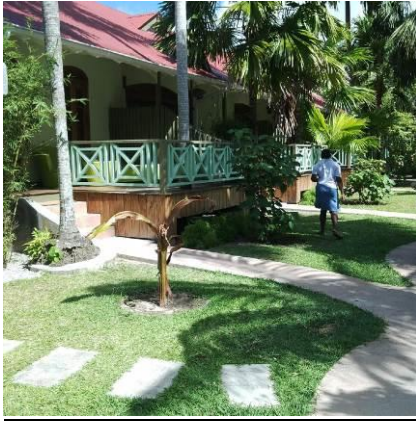
Outside Standard rooms