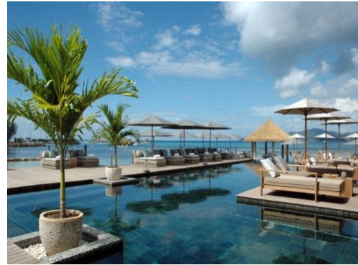
Sea & Pool View

INFINITY POOL BAR – A swim-up pool bar for enjoying refreshments from the cool confines of the pool overlooking the sea.