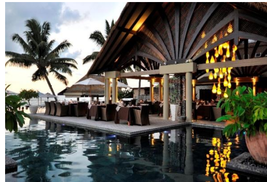
Le Combava Restaurant