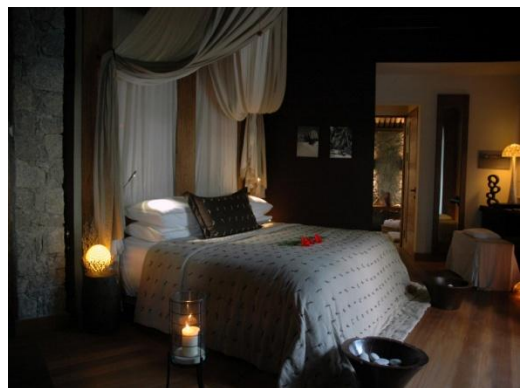
Villa de Charme