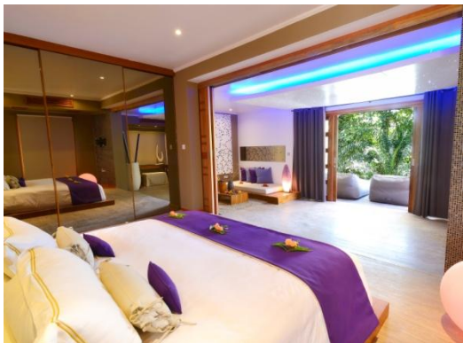
Garden Suite Residence