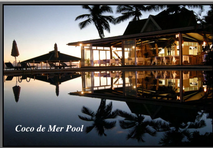
Coco de Mer Pool