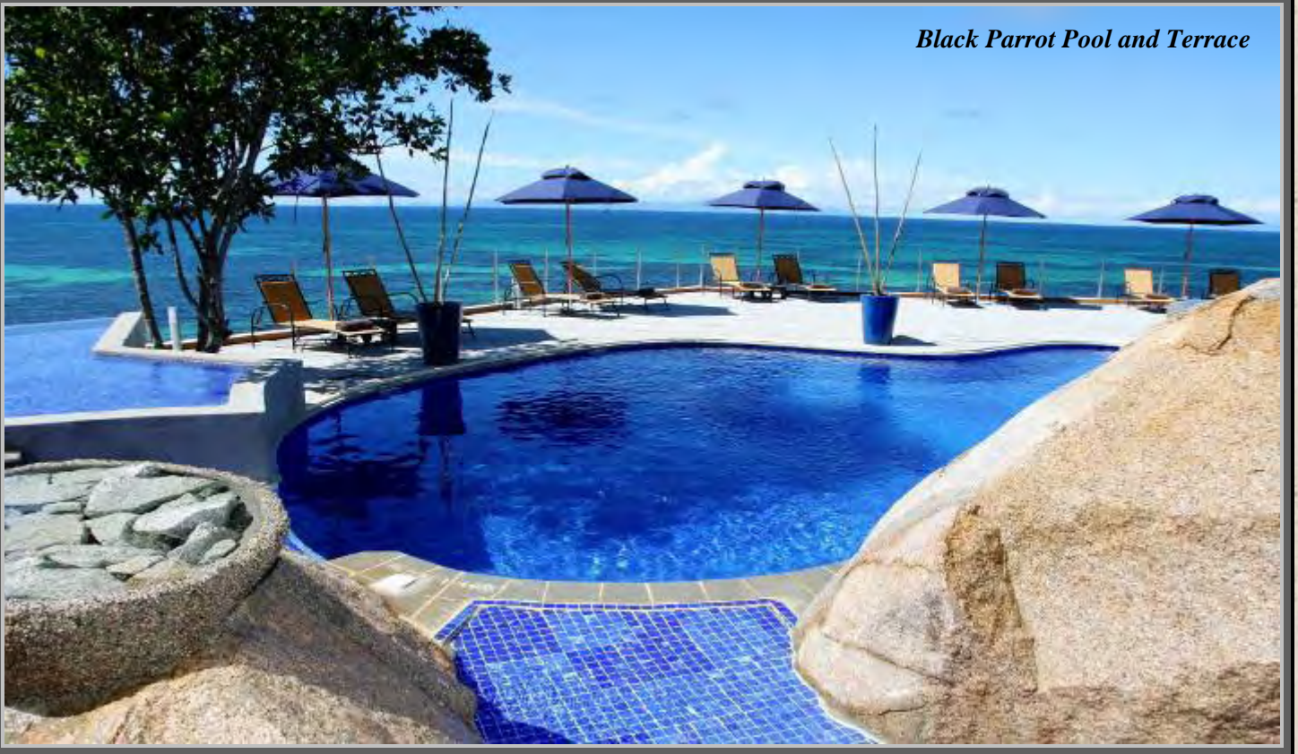
Black Parrot Pool and Terrace