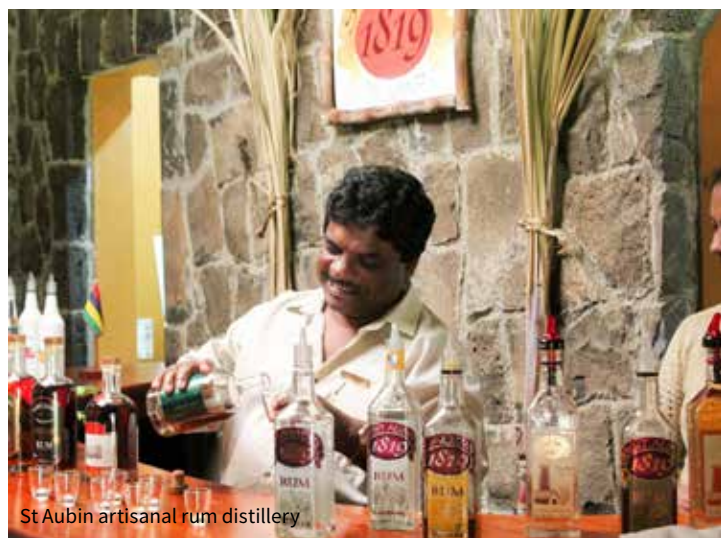
St Aubin artisanal rum distillery

Head for Saint Aubin Artisanal & Traditional Distillery for a guided tour of the distillery, a rum tasting and a visit to the Vanilla House, with time to explore the Anthurium plantation and exotic garden.