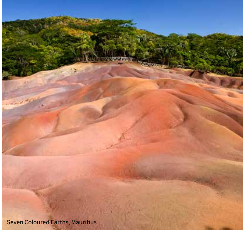
Seven Coloured Earths, Mauritius