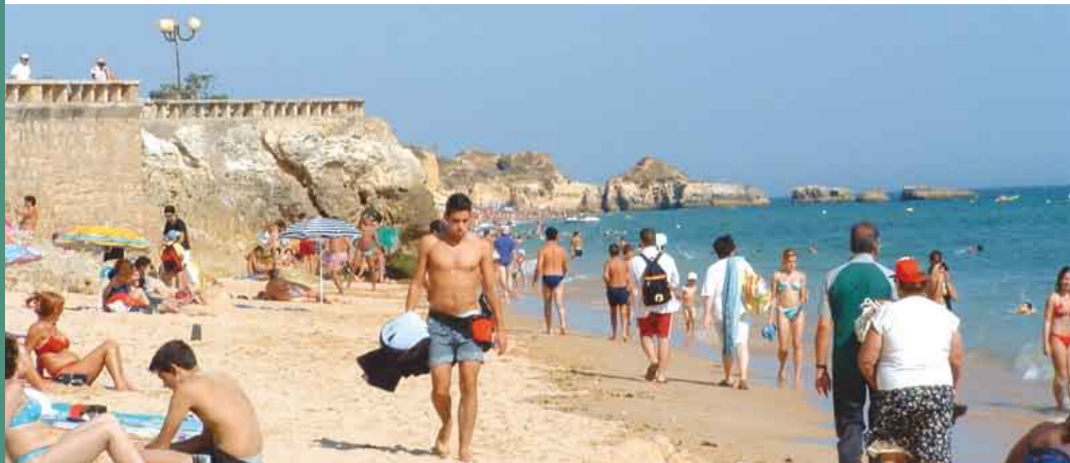
Beaches galore in Portugal