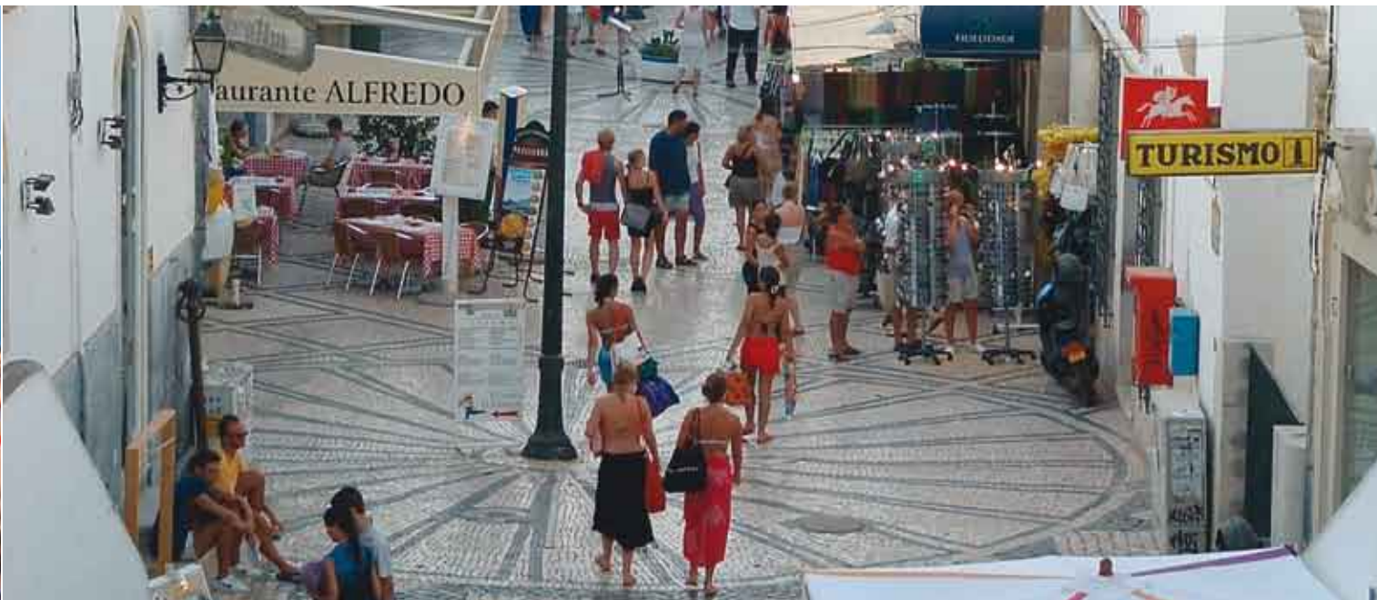
Street life in Portugal