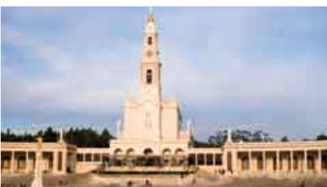
Fatima Cathedral, Portugal