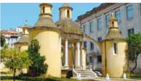
Manga Garden, Coimbra