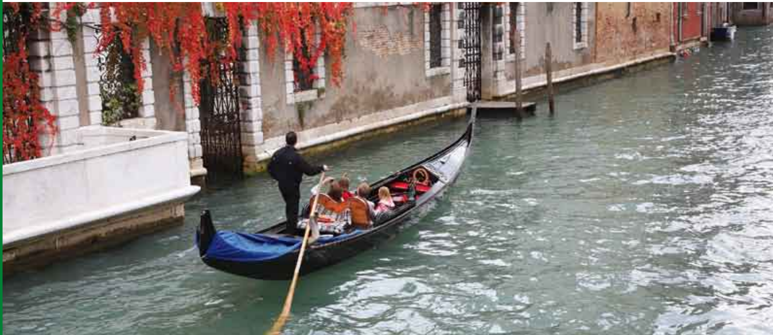
Gondola ride in Venice