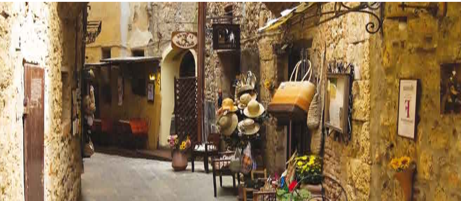
Old town street in Italy