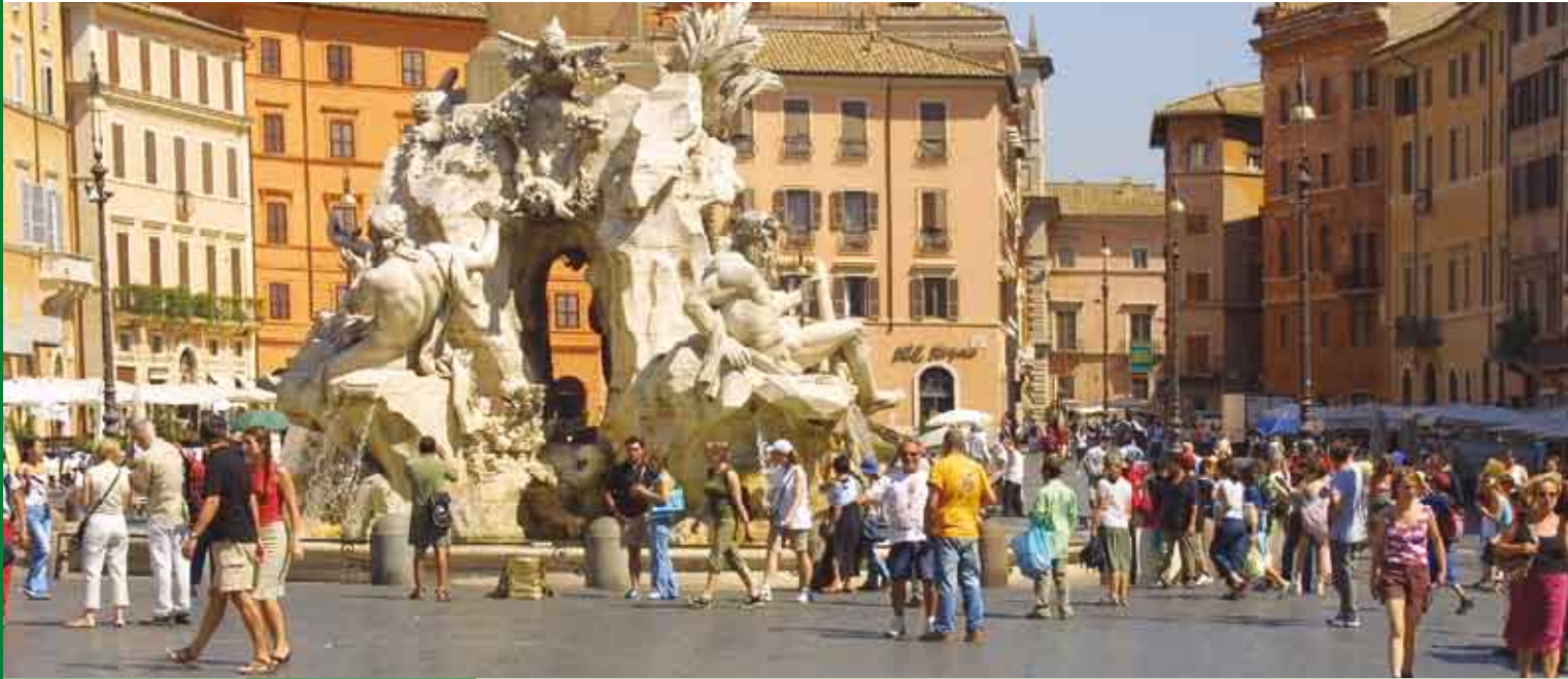
Piazza Navona, Rome