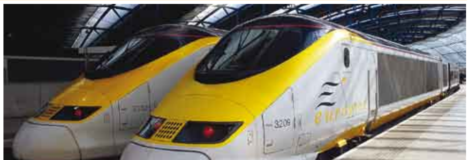
The sleek Eurostar Train

*Applicable on all direct services excluding the Disney train.