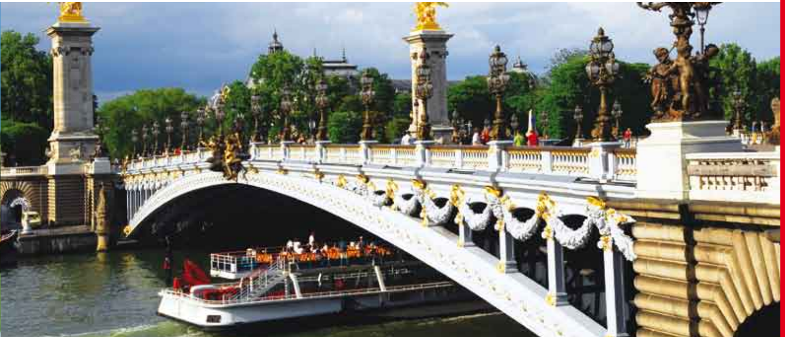
Stone Bridge over Seine in Paris