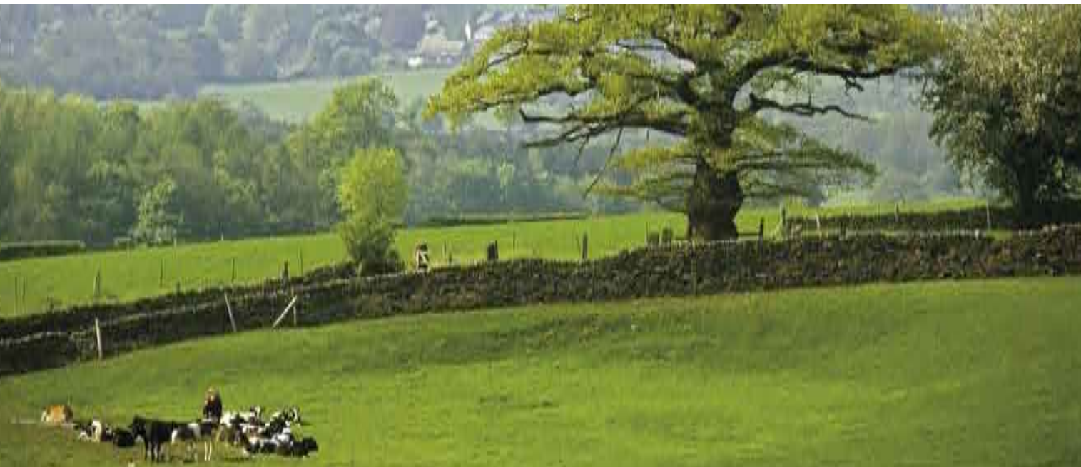
Lush English countryside