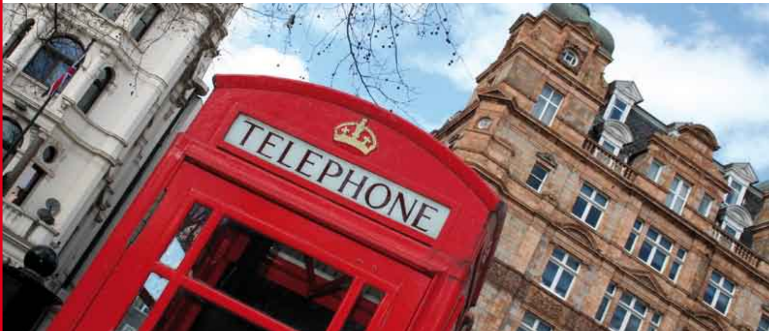
Red London phonebooth