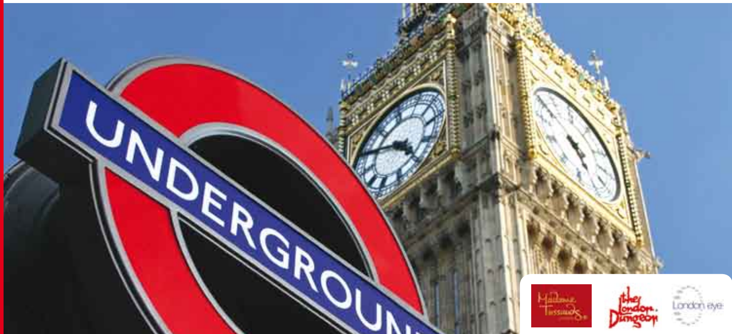
Out and about in London