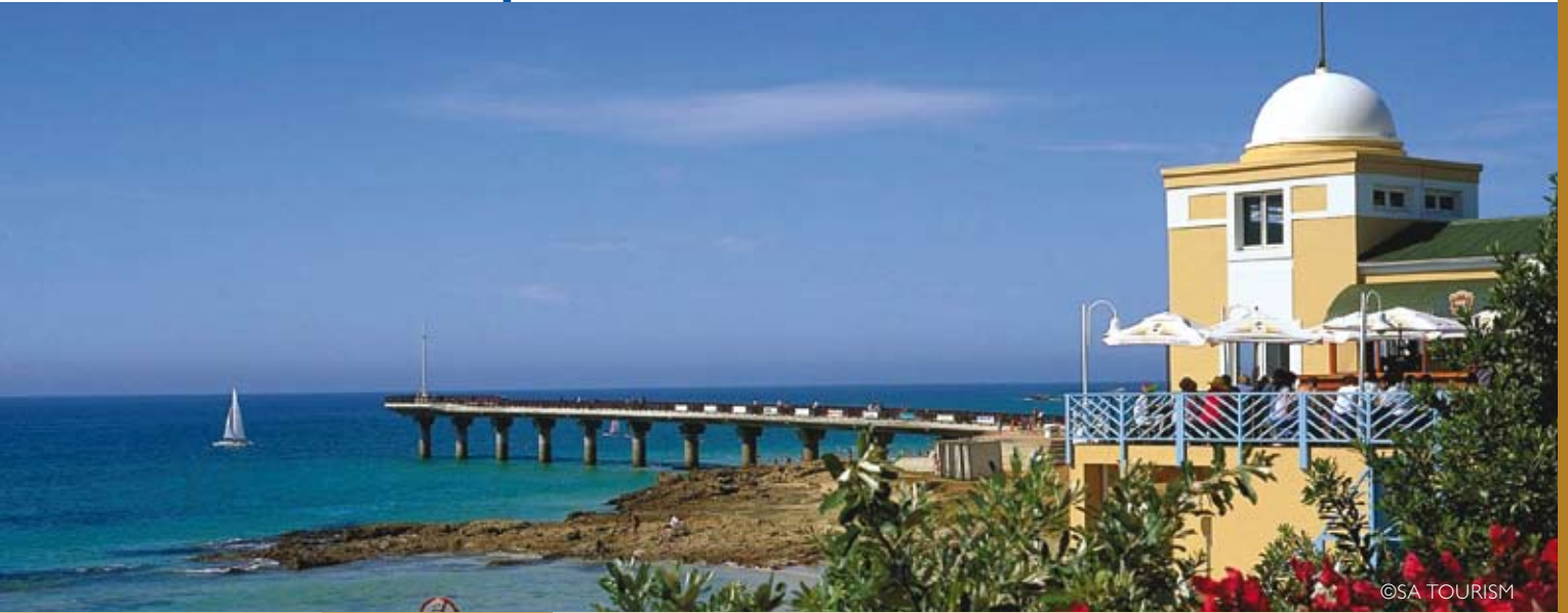
King's Beach, Port Elizabeth