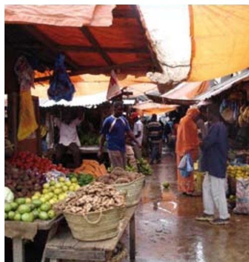
Stone Town street

Stone Town is the old city and cultural heart of Zanzibar where little changed in the last 200 years. It is a place of winding alleys, bustling bazaars, mosques and grand Arab houses. The unique architecture of Stone Town fuses Arabic, Indian, European and African influences. You can spend many idle hours and days just wandering through the fascinating labyrinth of narrow streets and alleyways.