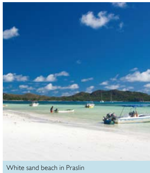
White sand beach in Praslin

The Seychelles islands are of the most beautiful islands in the world and still unspoilt offering days of perpetual summer and a rare combination of people and nature living in close harmony. The Seychelles is made up of 115 islands and they are located 1000 miles off the East African coast in the Indian Ocean. Of all of the islands, Mahe is the most developed and visited with many visitors venturing across to Praslin, La Digue and recently Silhouette Island. Mahe Island has 75 beaches in total with the most popular of all the beaches being Beau Vallon Bay. All the islands of Seychelles are unique with their own beautiful settings, crystal clear waters and shady swaying palms. Each island of Seychelles offers a unique experience with something to offer for every traveller.