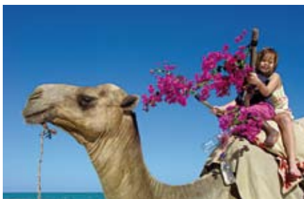
Camel ride on Mombasa Beach

There are flights to Kenya daily from Johannesburg with add on options also available from the other major cities. Flying time is approximately 4 hours from Johannesburg and you have the choice of Kenya Airways and SAA.