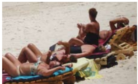
Basking in the sun in Mombasa