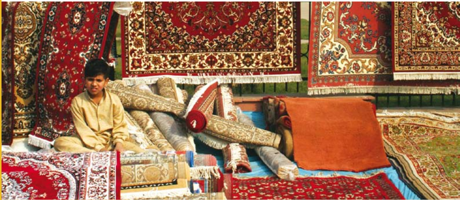
Selection of persian carpets