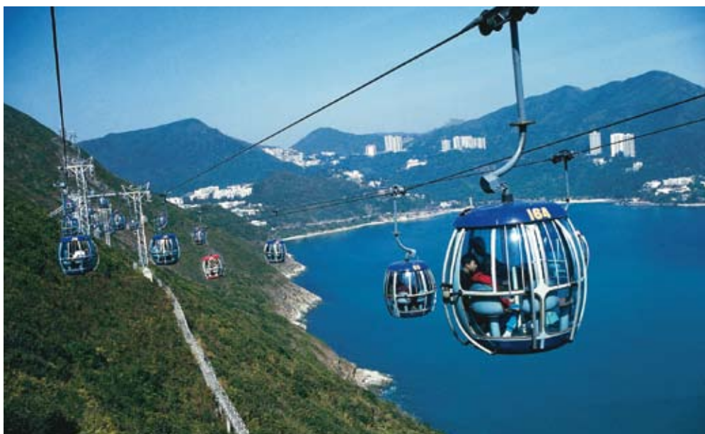
Stunning views over Hong Kong