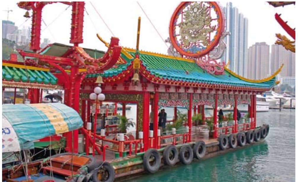
Traditional boat in Hong Kong Harbour