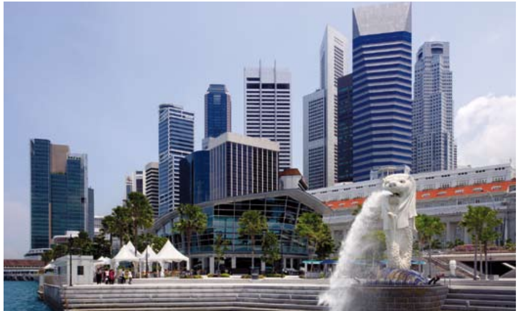
The Merlion in Singapore

Best avoided during the Monsoon season from Nov - Mar, as things like watersports could be cancelled over this period.