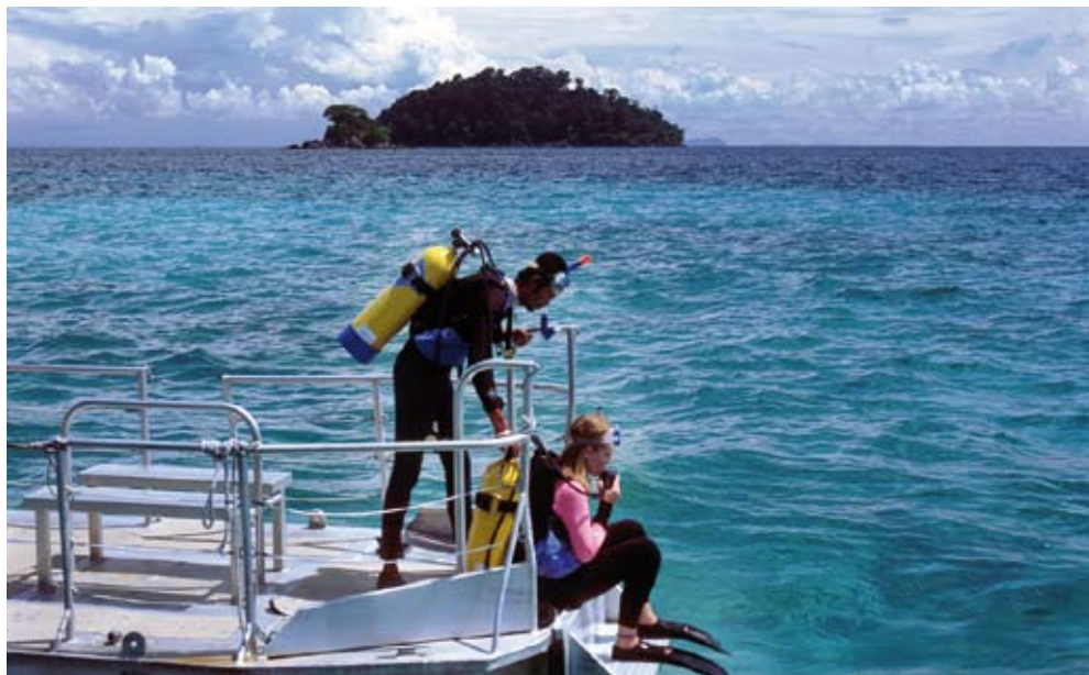
Diving in Langkawi