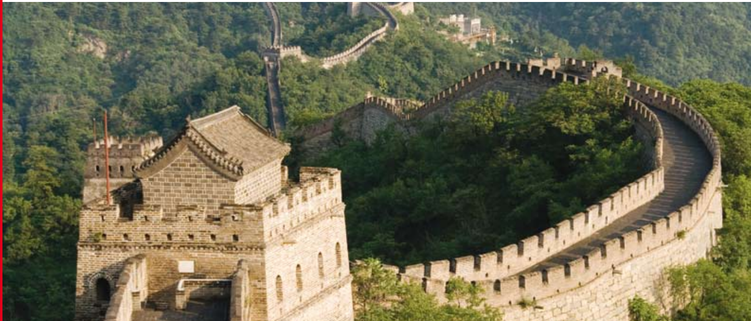
A section of the Great Wall of China