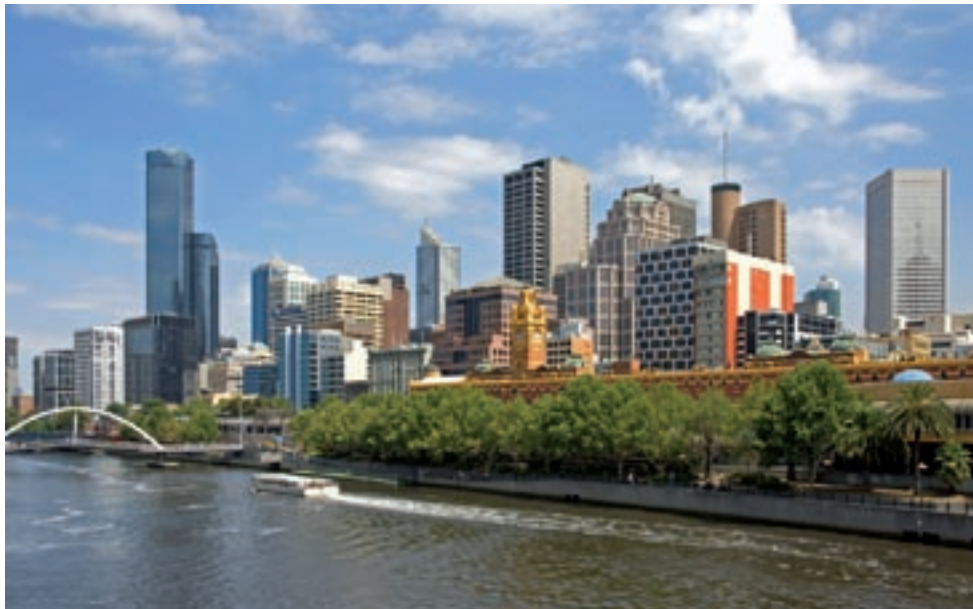
Melbourne has a wonderful blend of Architecture