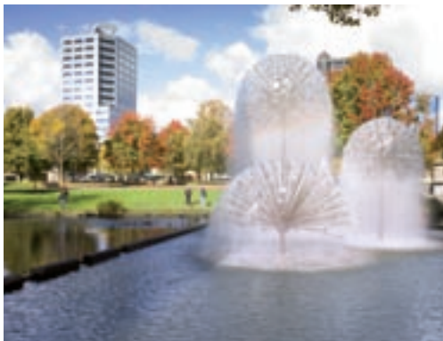
A Sunny Autumn day in Christchurch

Located on the east coast of the South Island, Christchurch is known internationally as 'The Garden City' due to its well established expansive parks and public gardens.