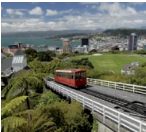
Wellington Cable Car