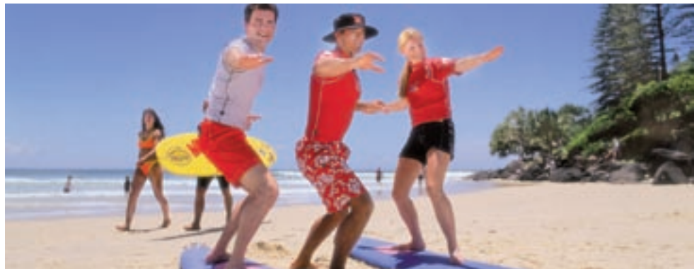
Learn to Surf!