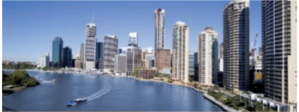
Steel & Glass Skyscrapers in Brisbane