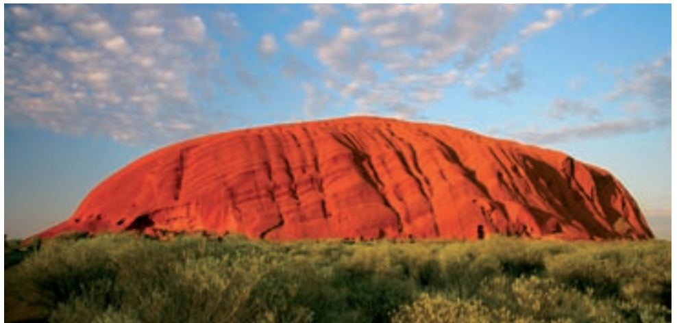
Sacred "Uluru" or Ayers Rock